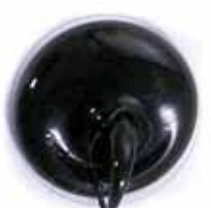
2721 Black C04