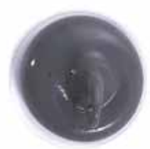
2723 Grey C137 (Anthracitegrey)