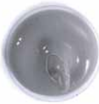
2734 Grey C18 (Sanitary)