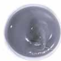
2735 Grey C1109 (Night)