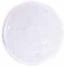
2719 Transparent C00