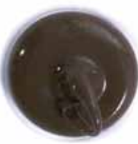
2736 Brown C05