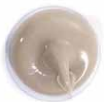
2738 Beige C10 (Bahama)