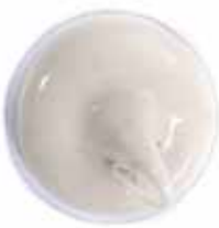
2724 Beige C1110 (Sandstone)