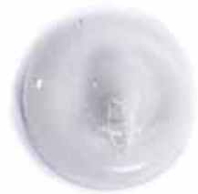
2727 Grey C80 (Pearl)