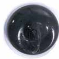
2874 Dark Grey C67 (Anthracite)