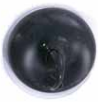
8042 Grey Anthracite Matt