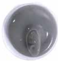
2722 Grey C56 (Concrete)