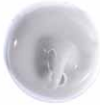
2729 Grey C1108 (Autumn)