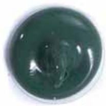
2742 Dark Green C37