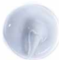
2728 Grey C45 (Chinchilla)