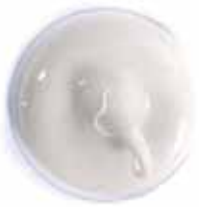
2725 Beige C08 (Jasmin)