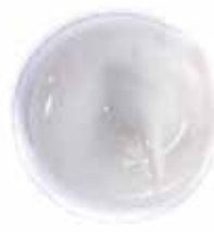
2726 Grey C38 (Light)