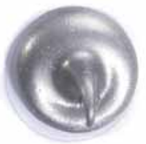
2743 Stainless Steel C197