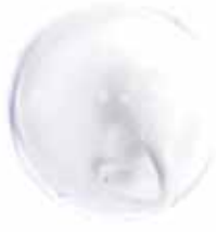
2720 White C01