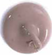
2739 Sunset C26