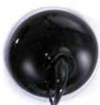
6057 Black Matt