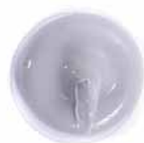
2733 Grey C43 (Manhattan)