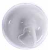
2730 Grey C71 (Joint)