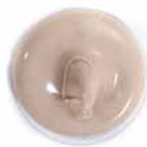
2737 Beige C82 (Red)